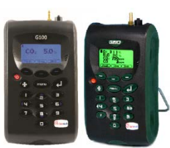
IAQ / Medical